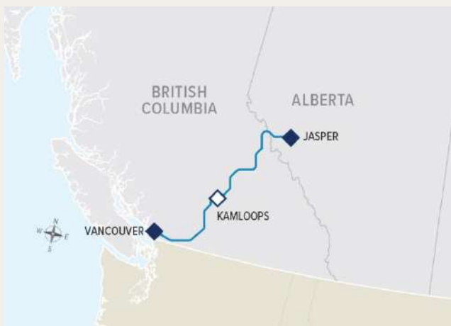
RAIL ROUTE MAP

Check out of your hotel and your vacation with us ends. (B)